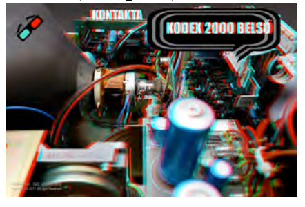
Figure 5: On the Hungarian Old Computers website, computers can be viewed internally in 3D.

However, in many cases it is not justified, and there is not always the possibility to travel to a particular museum. In such a case, " it's good if you have a virtual museum at hand". The 3D anaglyph technology, which enriches the website, is a visual-experience enhancer that does not, in spite of the virtual experience, replace the experience of real museums, but it does bring it closer. But even beyond, since an early computing device can be interesting not only through its external design, but also at the level of internal technical implementation, which is not always possible in museums. However, in the HOC virtual museum, I try not only to get the picture from outside but also from the inside (see Figure 5).