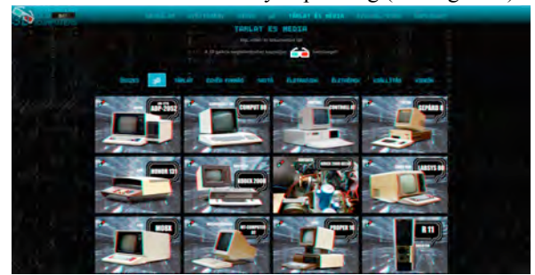
Figure 6: The HOC web page is maintained with the menus, below the 3D gallery gallery.

The HOC also has a list of vectors, NYT biographies and other sources of machinery and information, the content of which is constantly expanding (see Figure 6).