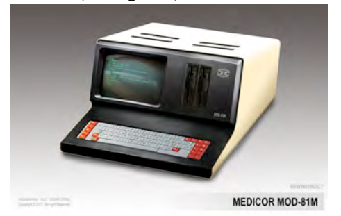
Figure 7: The reconstructed Medicor MOD-81M computer.

During the privatizations, the parent company, Medicor Works, was broken down into several smaller companies. I tried to get information from their successor and get confirmation that the reconstructed MOD 81 was credited with the original product but unfortunately they did not respond to my request. Therefore, this subject is currently available only in the HOC Museum, and currently this is the best photo that describes how the Medicor Mod 81 could be viewed (see Figure 7).