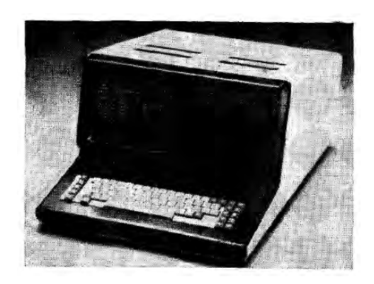
Figure 8: The original photograph of the Medicor MOD-81M computer as a "skeleton".

The beauty of the reconstruction work lies in the fact that the skeleton, like the archaeologists, was the surviving, especially bad quality photographs (see Figure 8), which, after thorough "cleaning" it, started a graphic work with four different types of home donor computers I've basically rebuilt the computer.