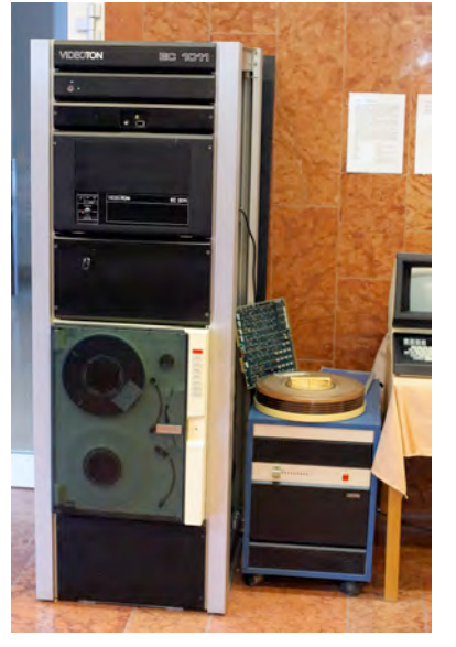
Figure 3: Videoton R11 Megamini Computer, "The Coffee Maker"

Had I miss a smiling story that was on my show and shows how "unknowns" are these machines for today's people. One of the clients arriving at the Debrecen District Court wanted to buy coffee from the Videoton R11 computer of the showroom, because she was looking at coffee machine and looking for where to throw the pot (see Figure 3).