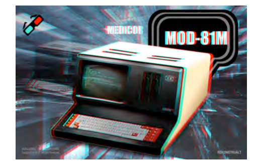
Figure 9: Anaglyph picture of the reconstructed Medicor MOD-81M computer.

Of course, the 3D Anaglyph version also features an exhibition (see Figure 9).